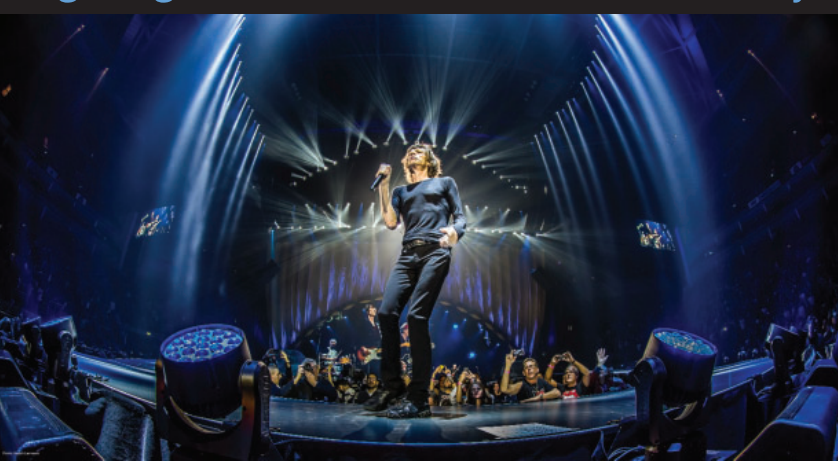
The Rolling Stones.